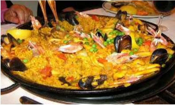
Delicious Paella, Salad and Homemade bread