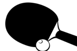
Table Tennis Club