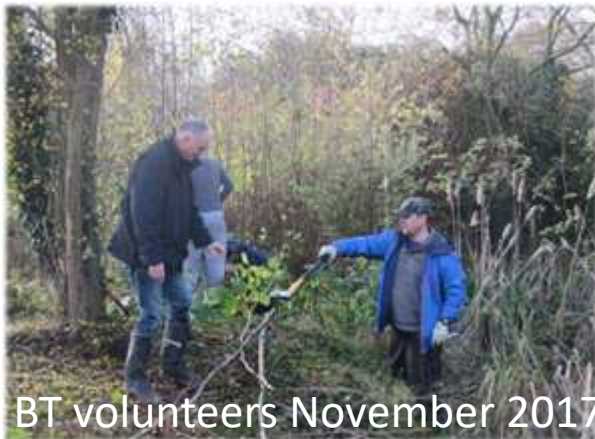
BT volunteers November 2017