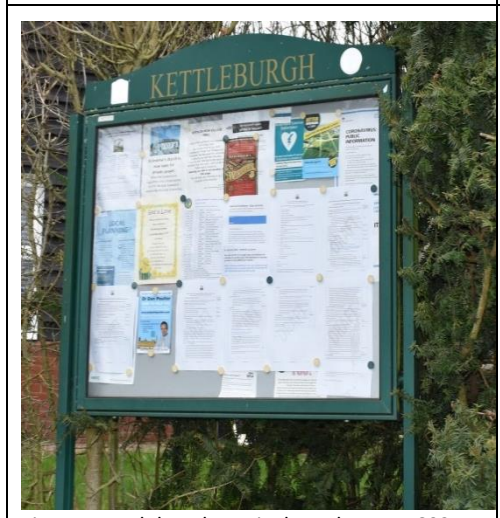
Figure 5Kettleburgh Noticeboard TM 44 602