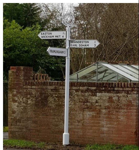
Figure 4 Leander Heritage Sign TM 263 601 T-Junction The Street & Easton Rd