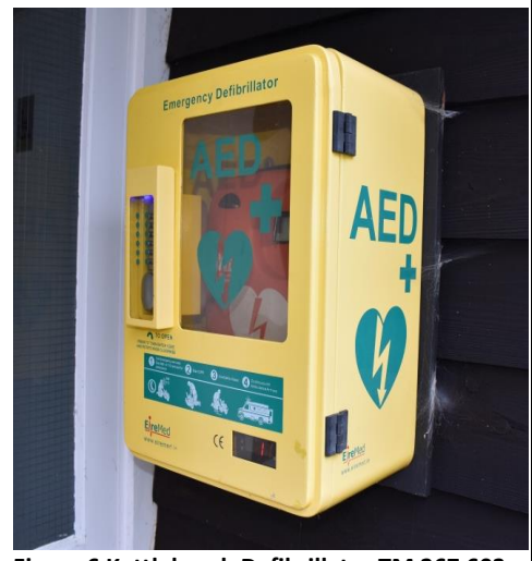
Figure 6 Kettleburgh Defibrillator TM 267 603