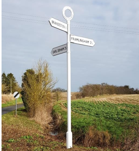
Figure 7 Leander Heritage Sign TM 268 605 Rectory Rd and The Street Junction