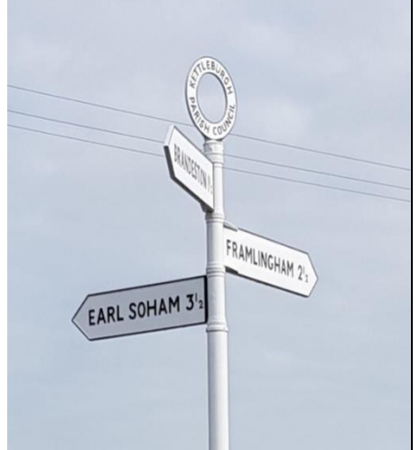
Figure 7 Leander Heritage Sign TM 268 605 Rectory Rd and The Street Junction