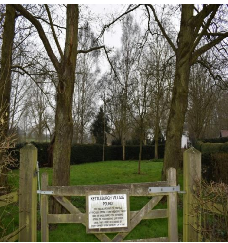
Figure 2 Kettleburgh Pound TM 264 597