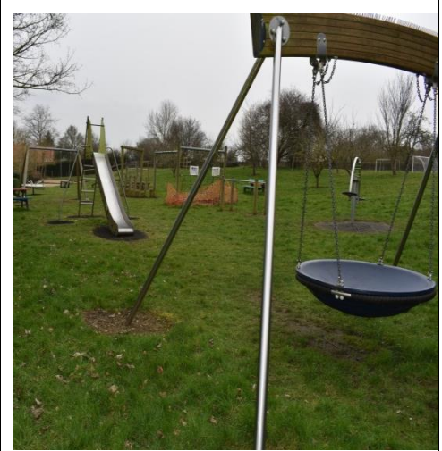
Figure 1 Kettleburgh Village Green TM 266 604