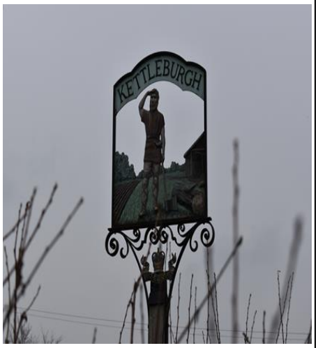
Figure 3 Village Sign TM 265 602